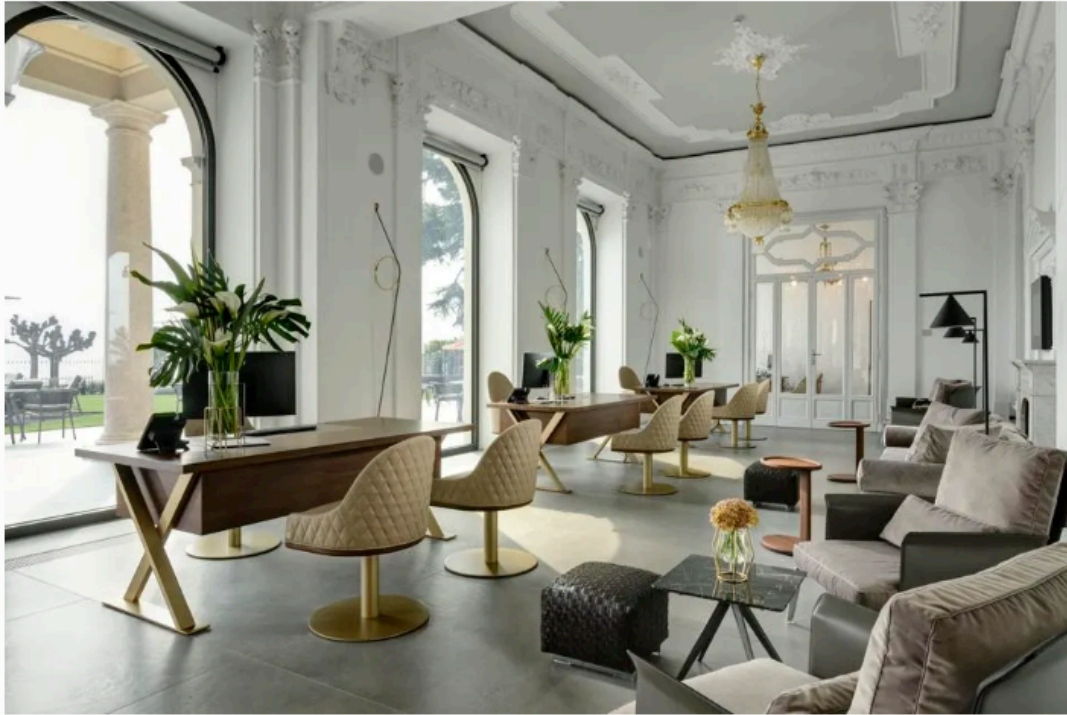
The lobby of the Grand Hotel Victoria, a restored 19th century neoclassical villa. ANDREA GETULI

Upstairs, rooms prioritize rest with bedside-operated black-out curtains, tailor-made pillows and comfortable beds. Staying in a 19 th century neoclassical villa that during the Belle Époque period had European nobility arrive by carriage, it's hard not to feel like royalty here. The restored property exudes all of its historic glamor with soaring ceilings, ornate columns and sparkling chandeliers. While popular Lake Como towns further south are a bustling frenzy of tourists, the Grand Hotel Victoria's location in the quiet town of Menaggio make it a secluded wellness getaway for anyone seeking calm and rejuvenation.