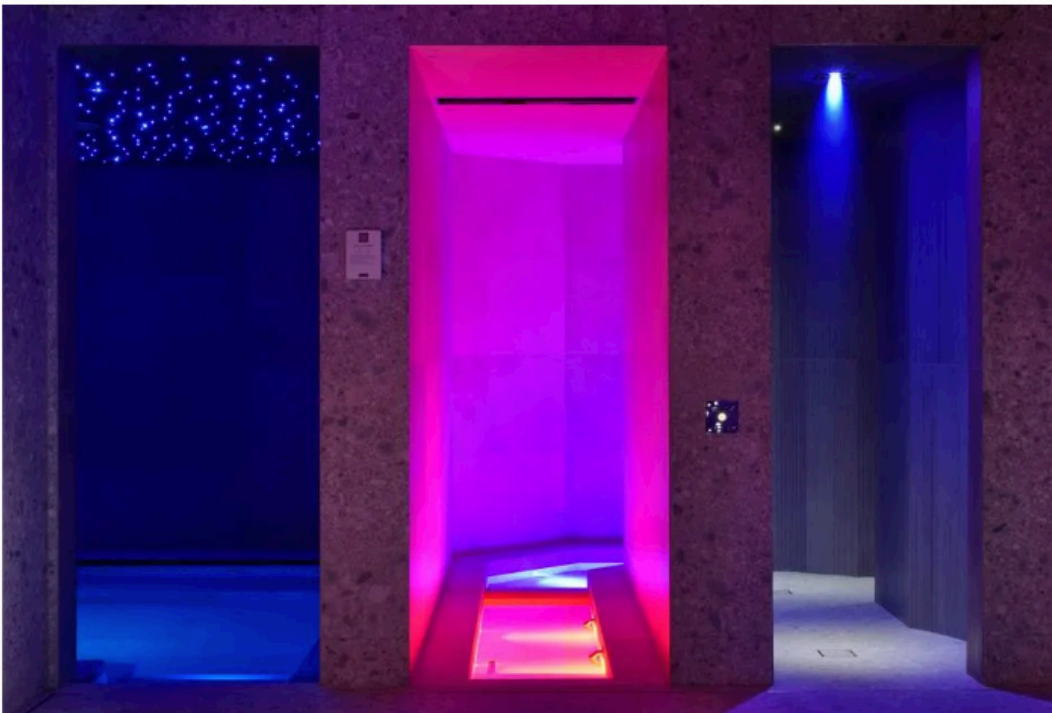
Inspired by Lake Como, Erre Spa has an intricate series of showers for a full hydrotherapy ... [+] GRAND HOTEL VICTORIA

Another relaxation room option is the 'fire room' which features a 13-foot fireplace, perfect for warming up after the 'ice room.' As cryotherapy (cold therapy) gains popularity for reducing pain and relieving mood disorders like depression and anxiety , this 'ice room' is unique for having ice particles that fall from the ceiling to rub on pressure points. It's meant to be completed in a circuit with the two saunas—one Finnish-style and one infrared.