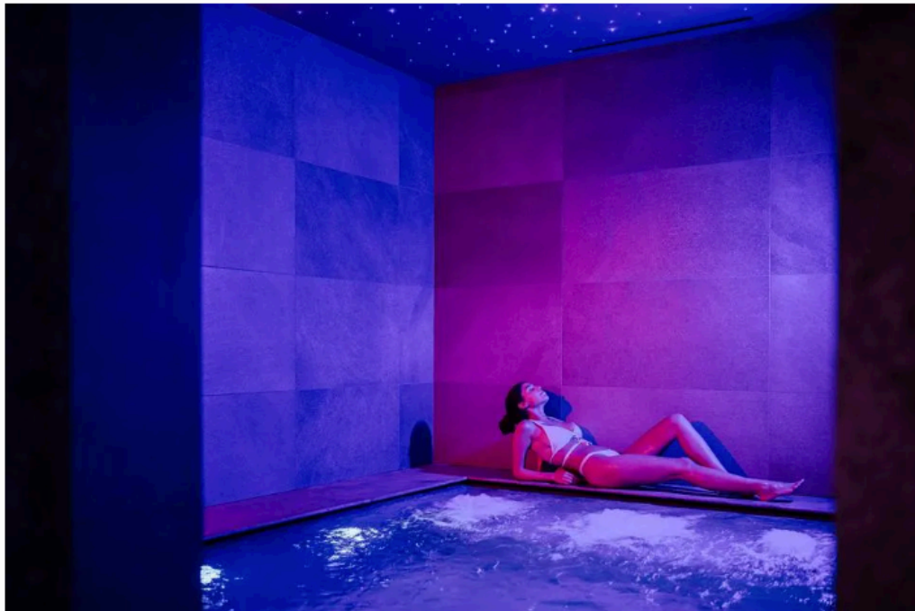
One of several thermal pools at Erre spa. GRAND HOTEL VICTORIA

North Americans flock to Lake Como for its tranquil waters sheltered by colorful villa-dotted mountains, but few venture as far north as Menaggio. It's worth the trek to experience Lake Como's largest spa, hidden underground at the Grand Hotel Victoria . The 12,800-square-foot Erre spa , puts North American spas to shame with an impressive range of wellness experiences.