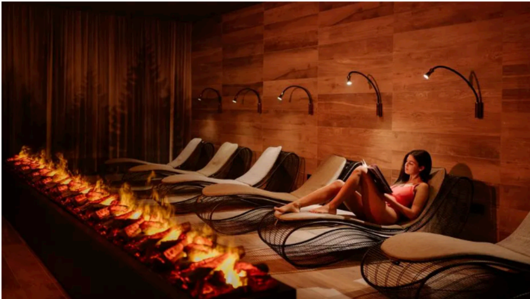
Erre Spa elevates the traditional relaxation lounge with a 'fire room' and 'silent room.' GRAND HOTEL VICTORIA

Another relaxation room option is the 'fire room' which features a 13-foot fireplace, perfect for warming up after the 'ice room.' As cryotherapy (cold therapy) gains popularity for reducing pain and relieving mood disorders like depression and anxiety , this 'ice room' is unique for having ice particles that fall from the ceiling to rub on pressure points. It's meant to be completed in a circuit with the two saunas—one Finnish-style and one infrared.