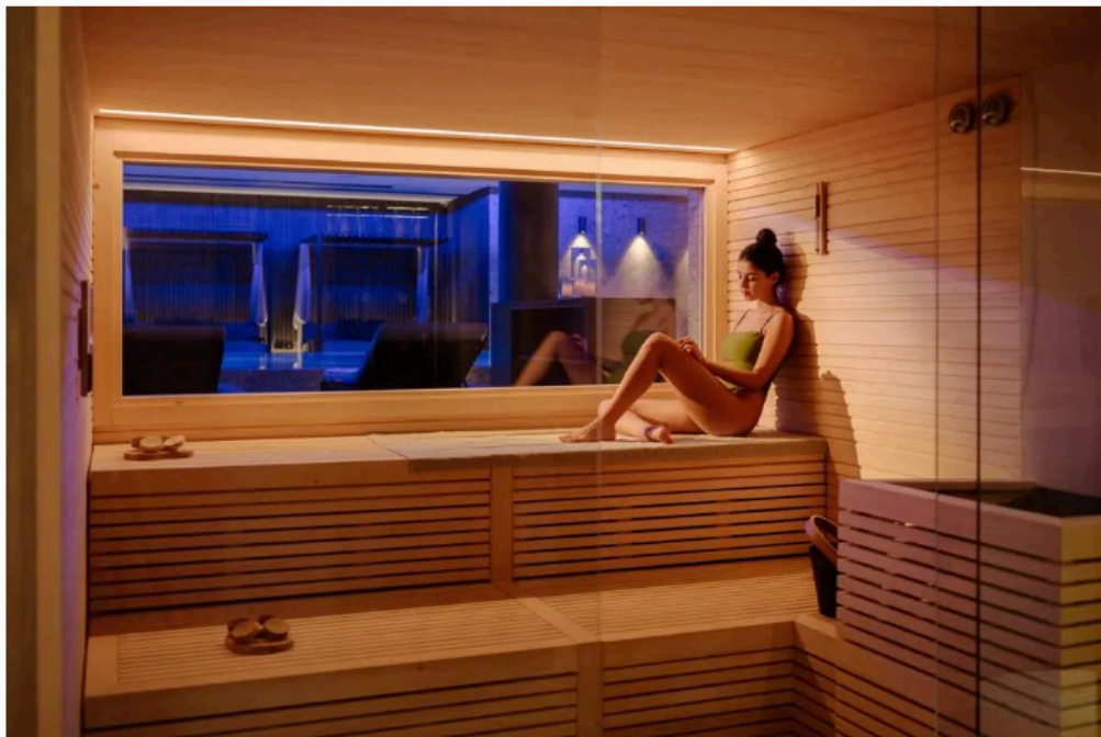
The Erre Spa offers saunas of varying temperatures. GRAND HOTEL VICTORIA

North Americans flock to Lake Como for its tranquil waters sheltered by colorful villa-dotted mountains, but few venture as far north as Menaggio. It's worth the trek to experience Lake Como's largest spa, hidden underground at the Grand Hotel Victoria . The 12,800-square-foot Erre spa , puts North American spas to shame with an impressive range of wellness experiences.