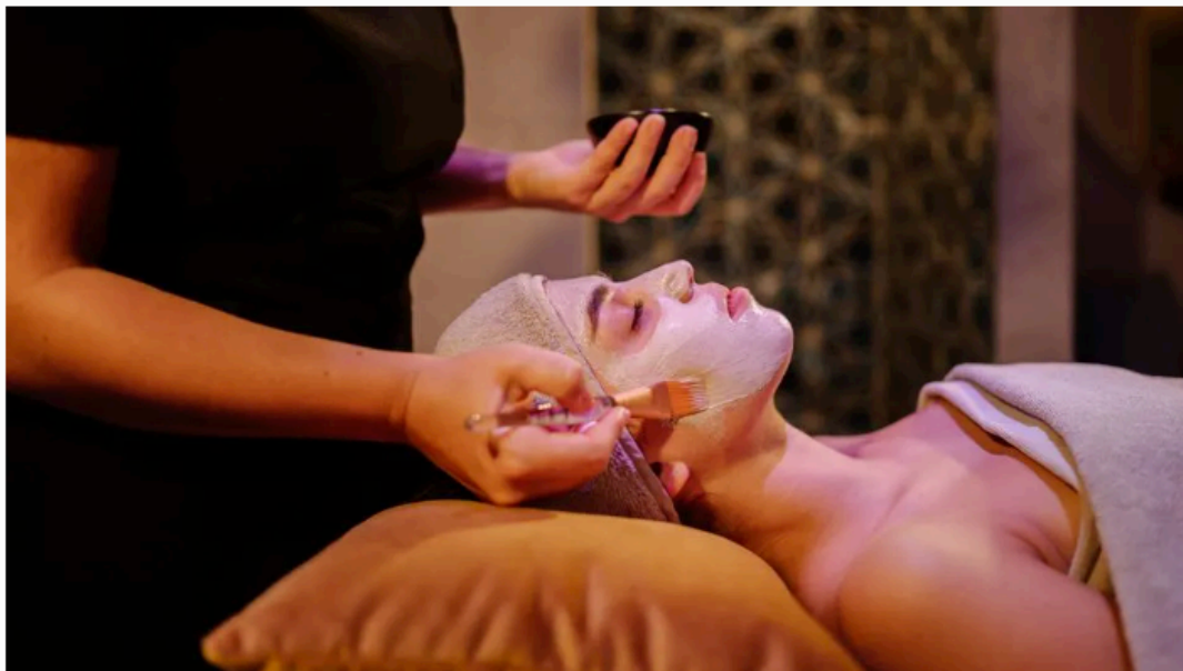
Innovative treatments utilize local ingredients like seaweed mud and green clay. GRAND HOTEL VICTORIA

If you especially like the aromatherapy aspect of the showers, the steam shower adds the moist heat of steam to really give the scent a full effect. There is even a 'water bucket shower' meant for cooling off after the dry heat of the Finnish sauna. If bathing is more your style, a 65-foot pool and warm jacuzzi (complete with a twinkling ceiling meant to replicate a starry night sky) are ideal for soaking.