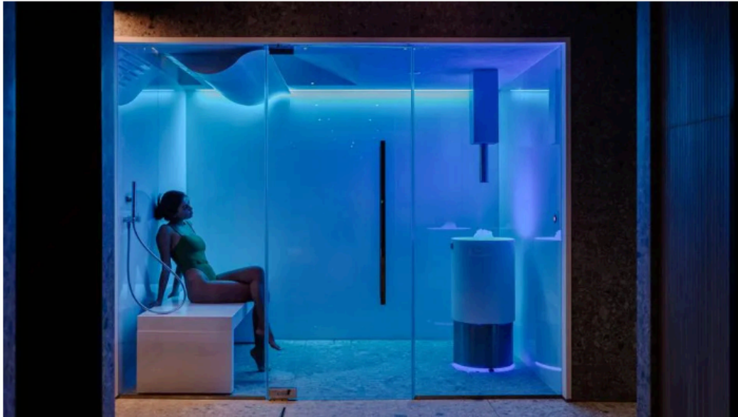
The 'ice room' at Erre Spa. GRAND HOTEL VICTORIA

If you especially like the aromatherapy aspect of the showers, the steam shower adds the moist heat of steam to really give the scent a full effect. There is even a 'water bucket shower' meant for cooling off after the dry heat of the Finnish sauna. If bathing is more your style, a 65-foot pool and warm jacuzzi (complete with a twinkling ceiling meant to replicate a starry night sky) are ideal for soaking.