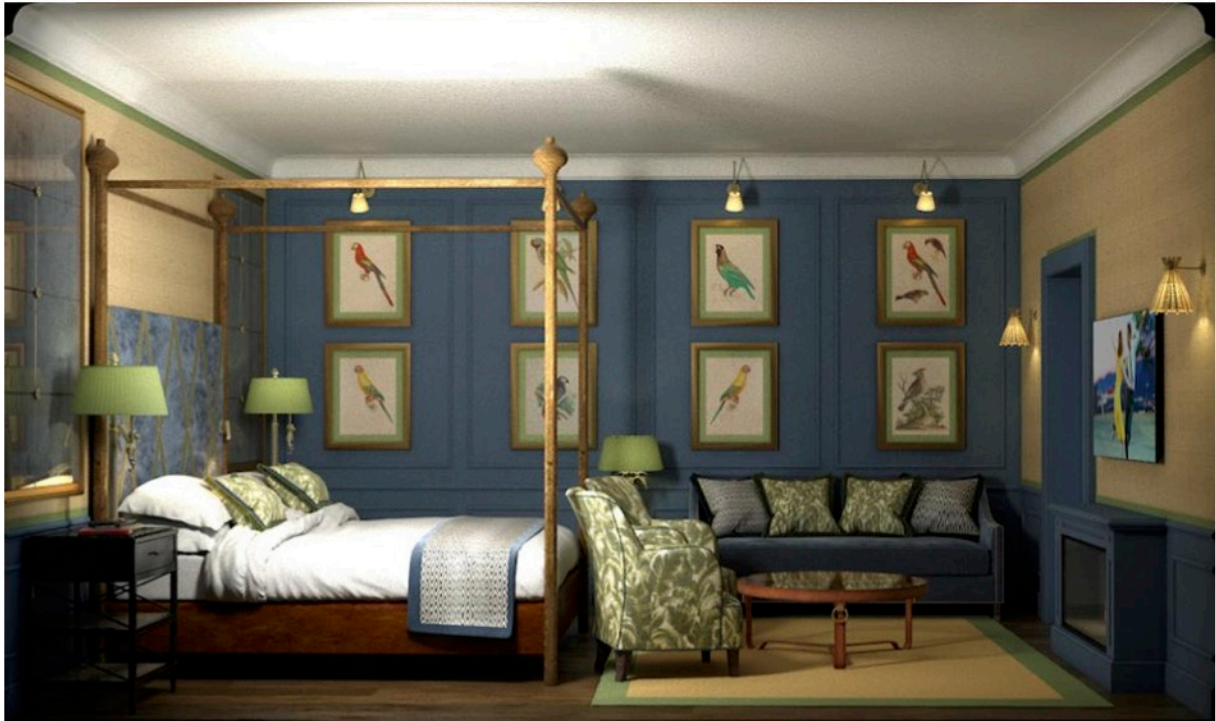
One of the tastefully decorate guest rooms at the hotel Tornabuoni IL TORNABUONI