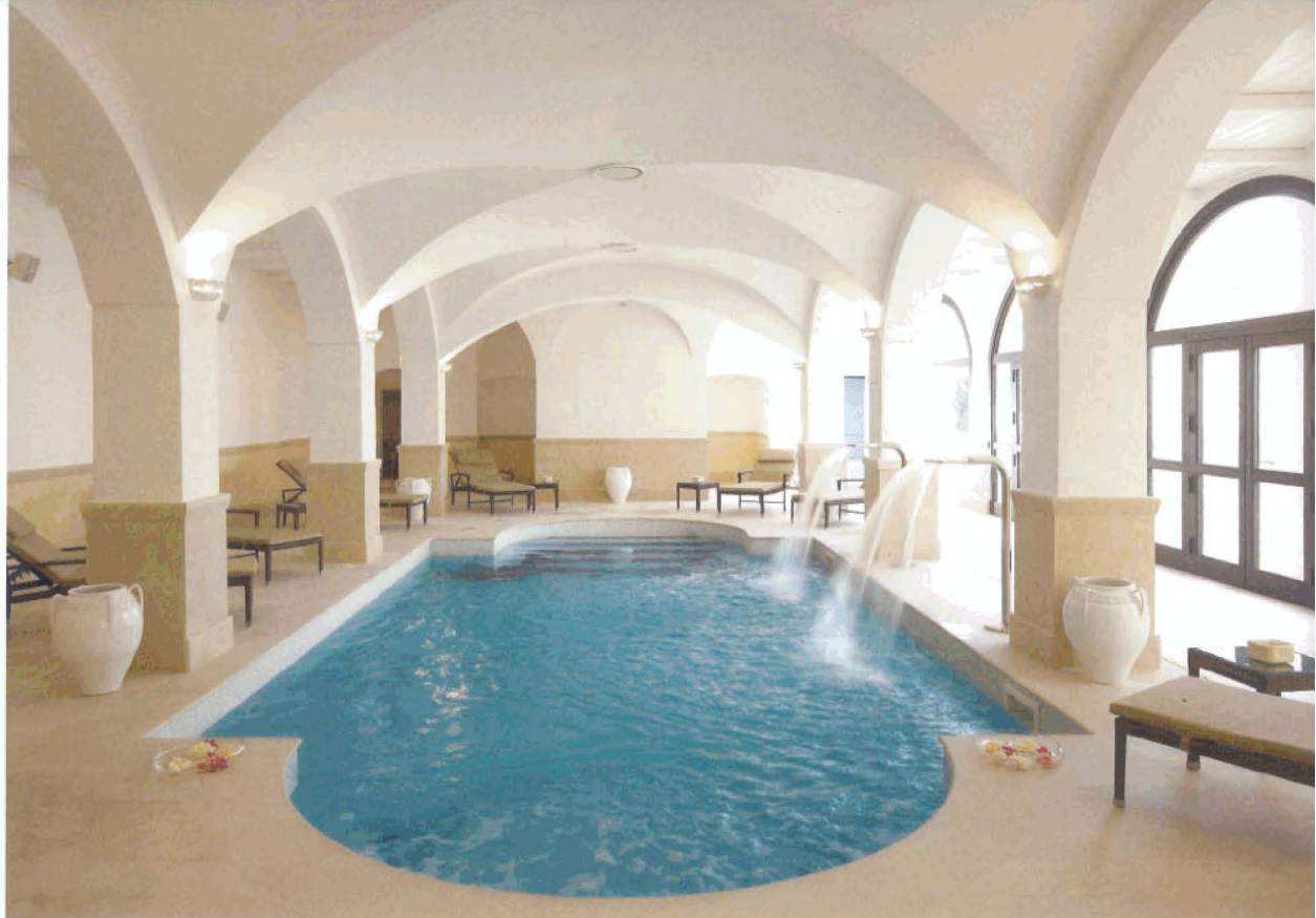
Above: the indoor pool and Decléor spa at Borgobianco Resort in Puglia. Below: formerly a hilltop village, Castel Monastero in Siena is now a 76-room hotel.

Finally, for a weekend break that promises to be both musically and visually stimulating, the Austrian city of BREGENZ on the shores of Lake Constance offers two compelling attractions. First there's a retrospective of work by the sculptor Antony Gormley at its Kunsthhaus ( www.kunsthhaus-bregenz.at ; July 12 to October 4), to be followed next year by his installation called Horizon Field , in which 100 life-size cast-iron statues modelled on the artist will be arranged in a tract of dramatic alpine landscape. Then on July 22 the annual lakeside opera festival starts ( www.bregenzerfestspiele.com ; till August 23) – the one that features in the Bond film Quantum of Solace – with Aida being performed on its extraordinary floating stage. ♦