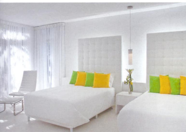
Above: contemporary white chic presides at Le Caméléon on Costa Rica's Caribbean coast.