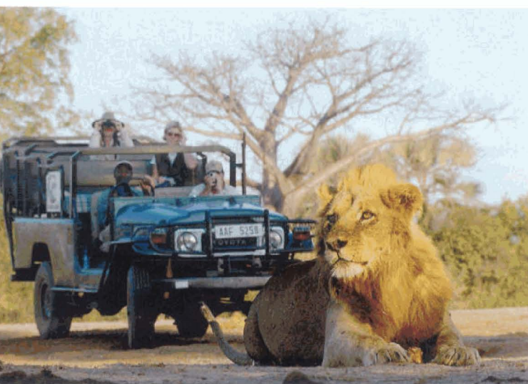
Above: the pioneering Chiawa Camp in Zambia celebrates its 20th anniversary. Below: Antony Gormley's Critical Mass II on show at Kunsthhaus in Bregenz, Austria.